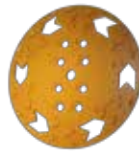
E12020 PCD GRINDING DISC Ø250 MM